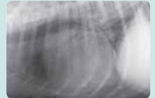
Chest x-ray of a dog with an enlarged heart and heart failure. Specifically formulated cardiac diets are a key part of treatment.